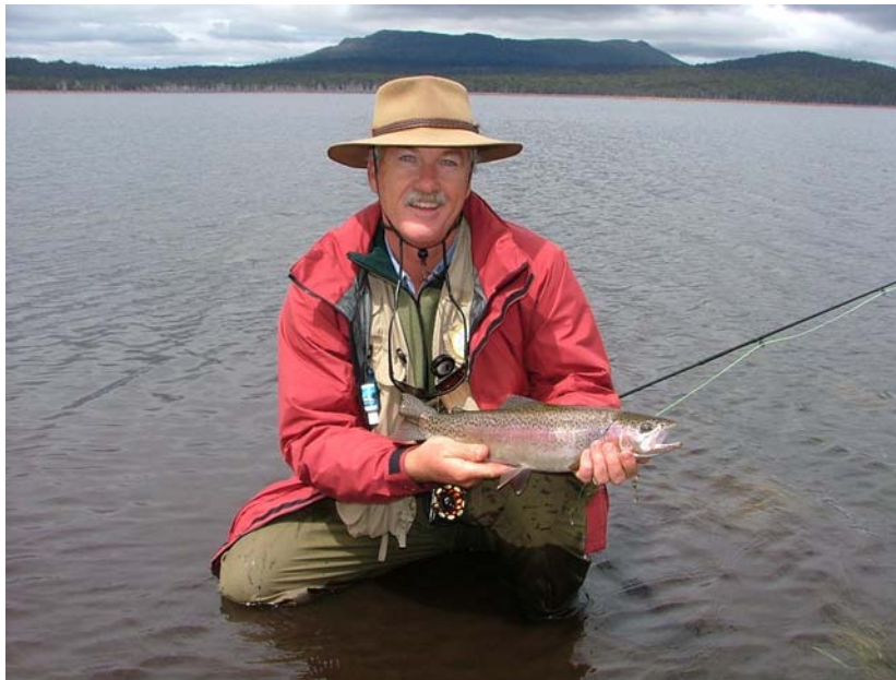
One of the rainbows