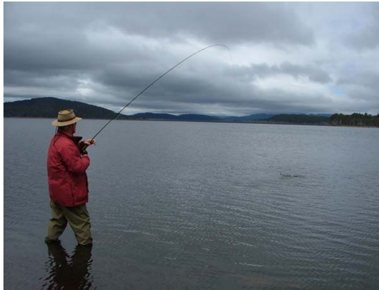
Most fish were taken in water less than knee deep

1 ½ lb – 2 ½ lb category. We fished the lake for 4 days straight and the fish tailed all day for every one of those days. Not one fish would have been taken from water more than knee deep. Most were Brown's taken on tags, however the few rainbows we caught sure knew how to put the accelerator down. In the 4 days that we fished King William we caught and released over 60 fish.