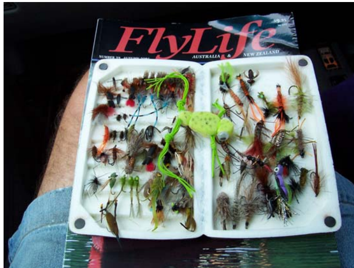
The infamous “Frog” Pattern