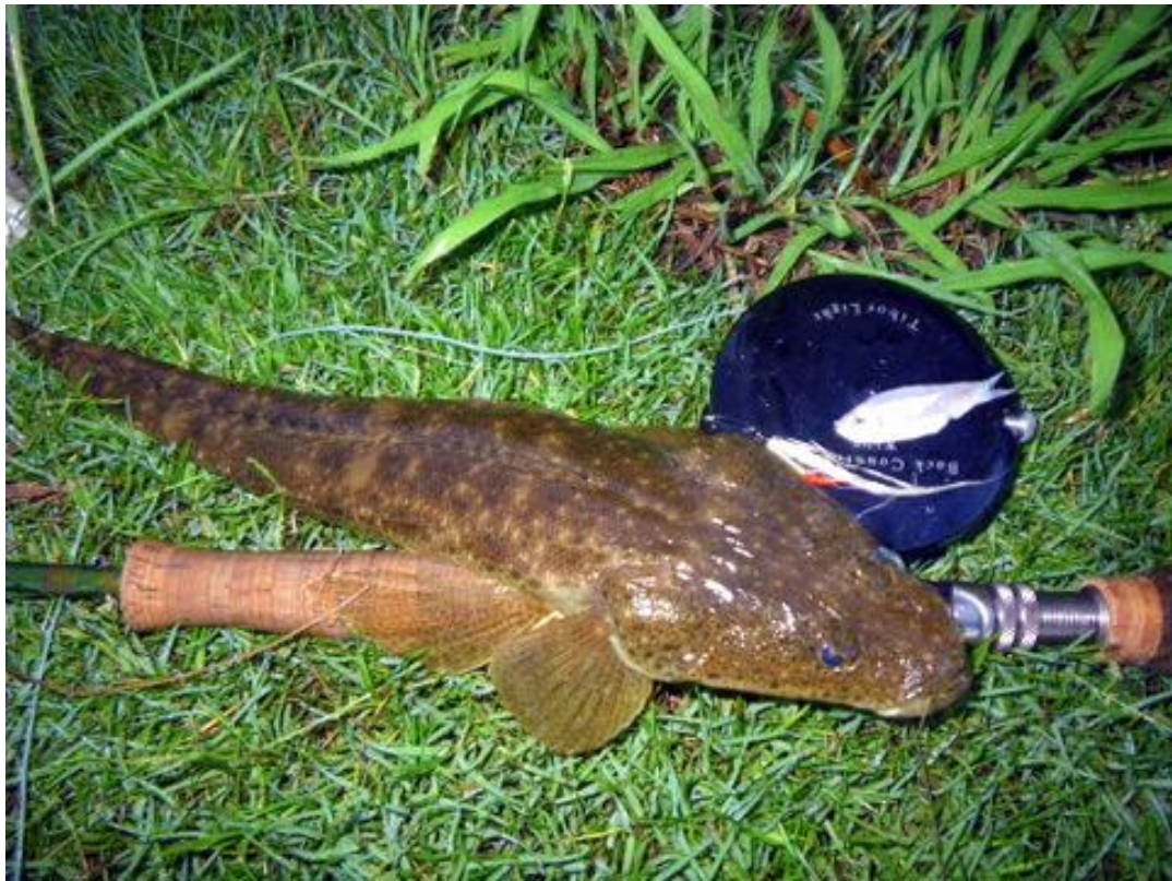
This lad was keen; he had a crack at Paul's fly and the fly rod. It's only a Sage

Emerald Lakes is a fair expanse of water and as such presents plenty of options for land based fishing. This gives people ample space to work the waters and cast to different types of structure.