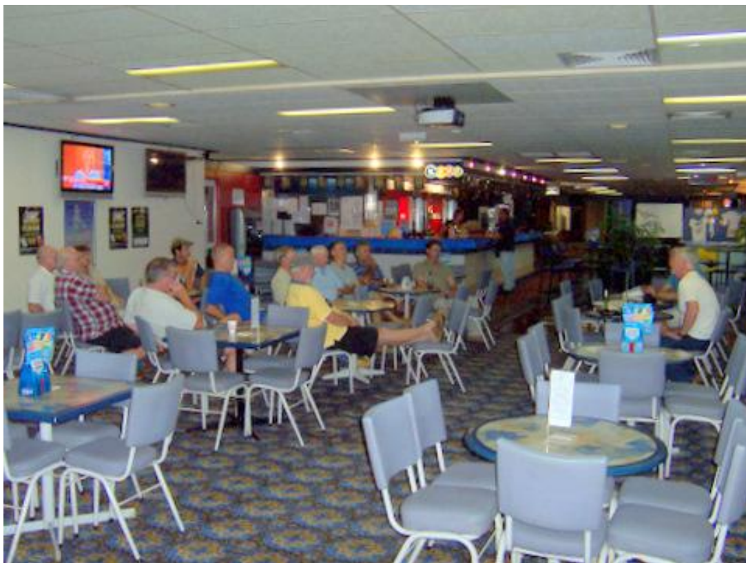
January Club Meeting

It would appear that many of the club members were suffering with cabin fever following the Christmas break. They turned out in good numbers to take the advantage to catch up and have a chat about their adventures over the Christmas break and kick start the 2011 club year.