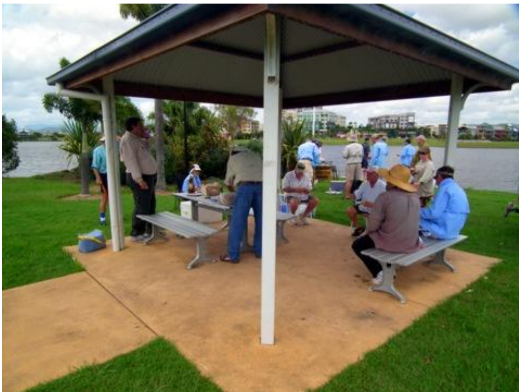
A perfect close to a good mornings fishing

Emerald lakes has a small gazebo near the boat launch area that provided the perfect spot to chill out and compare notes on the great mornings fishing.