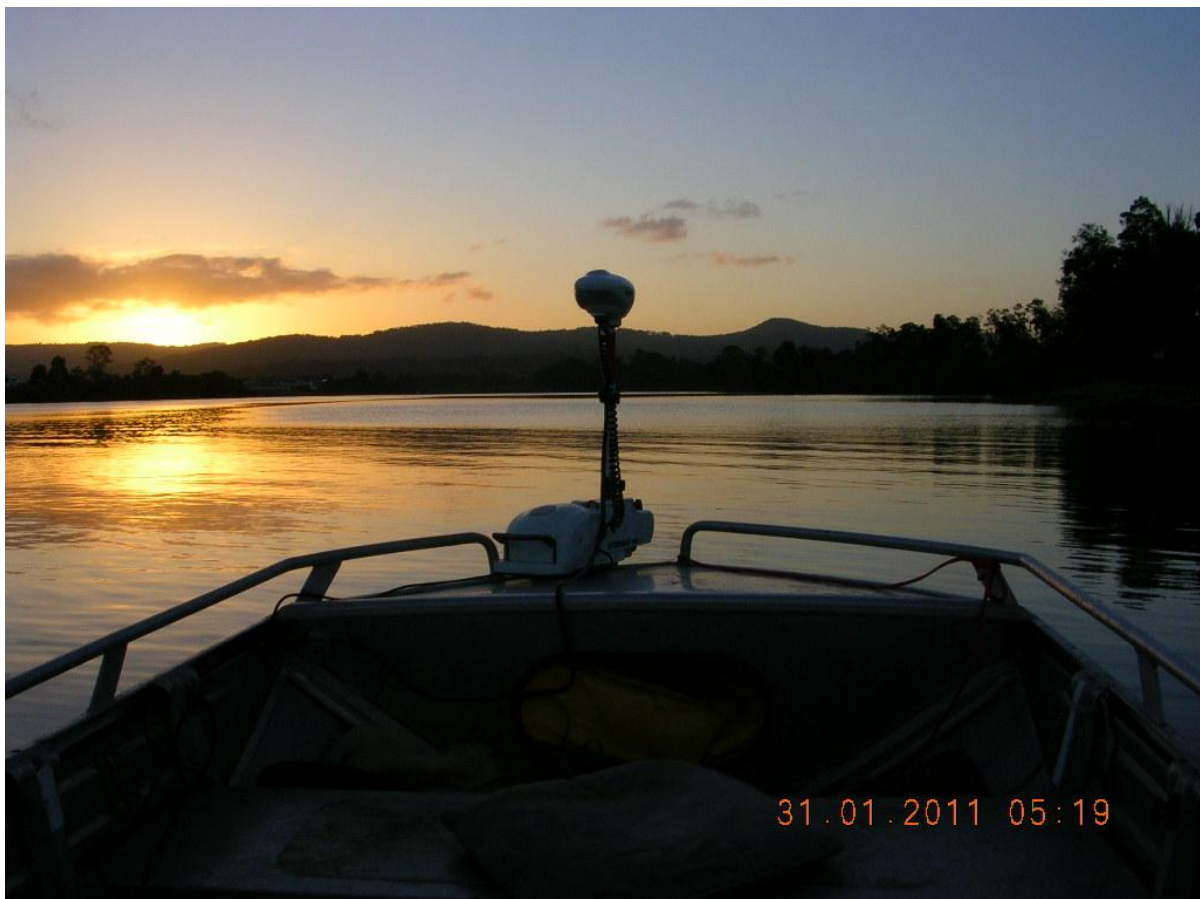
What a way to start the day (By Kruger)