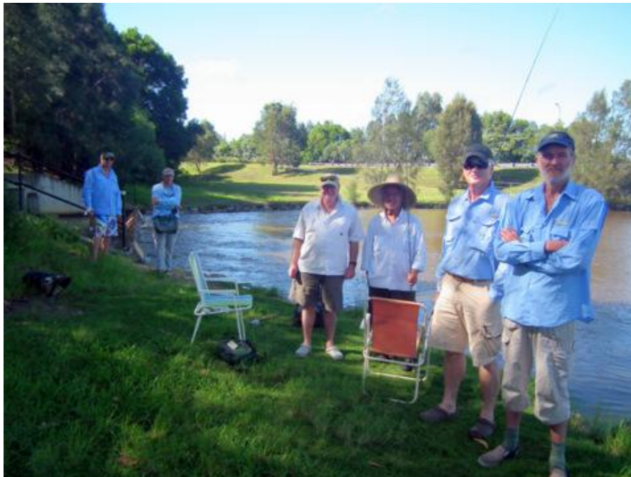
The moving water and good shade was the main attraction for this group

A few of the members took to the water in their boats to gain the advantage of prospecting with their flies close to the shore and working them slowly back to the boat. Although this technique often works well in this location it didn't produce the goods on this occasion.