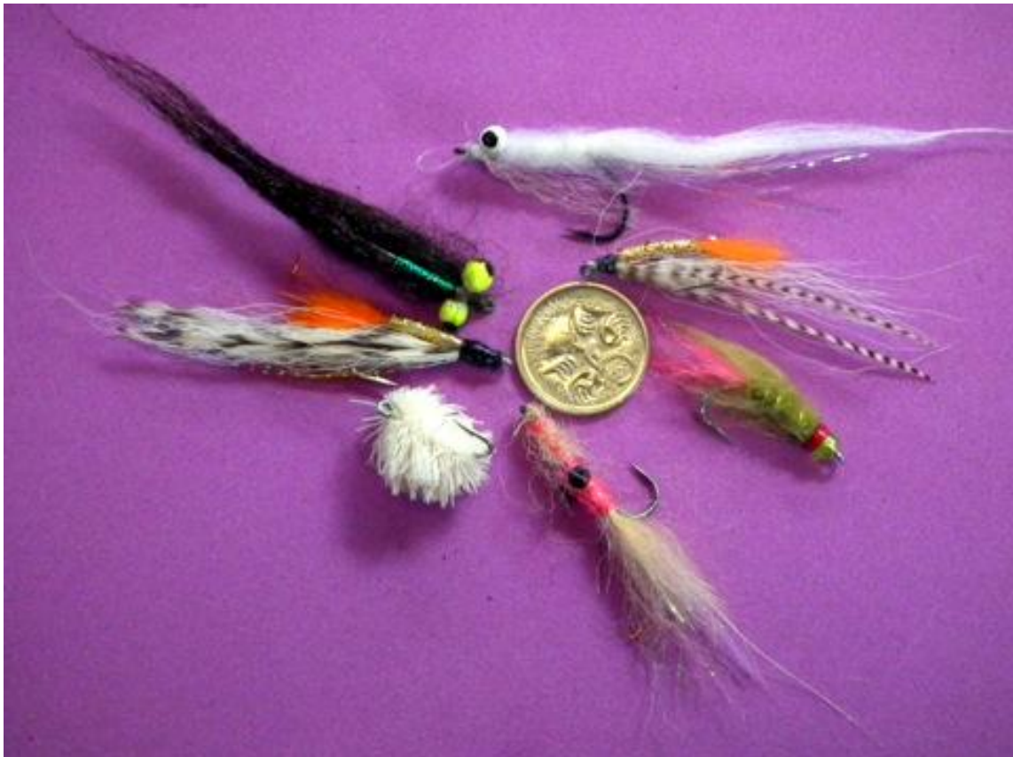
Flies that produced on the day

It was interesting to see what creations had produced the goods by the close of the morning. Apart from Jon's loaf and a half bread fly, the go to flies were mostly medium to small bait fish patterns or smallish shrimp patterns.