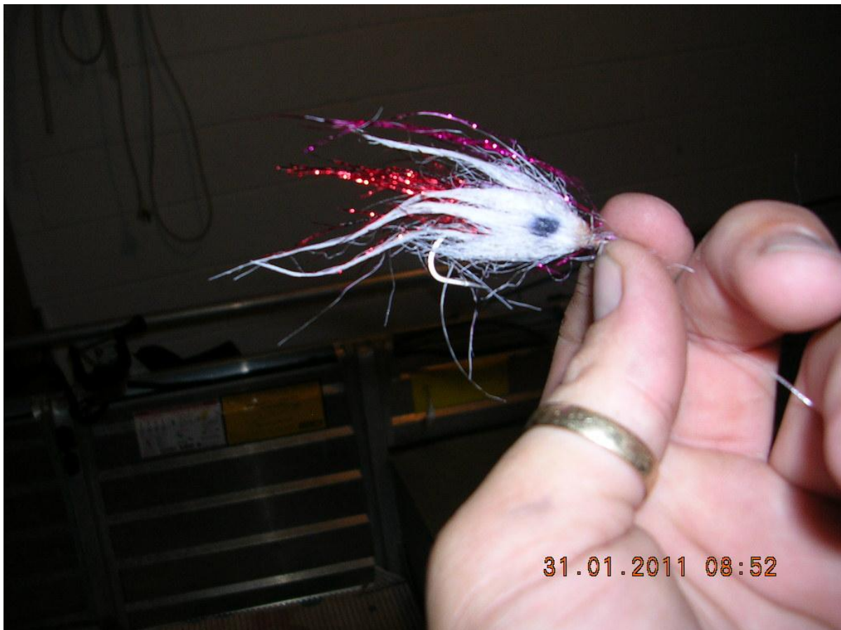
Kruger's jack fly