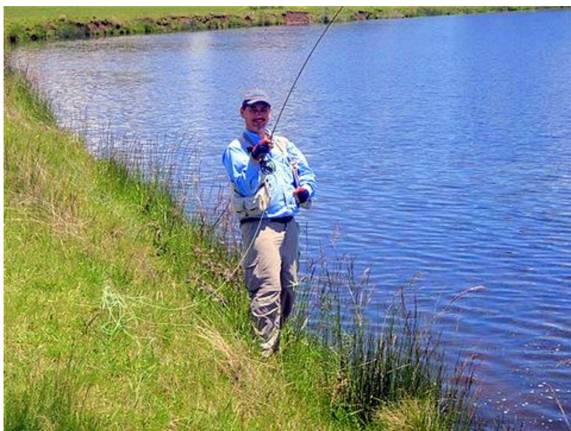
Ezvin into Billy's trout