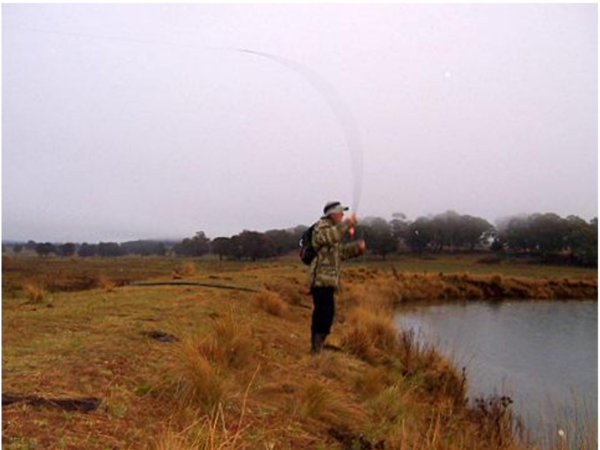
Nick Kneipp loading up at Billy's