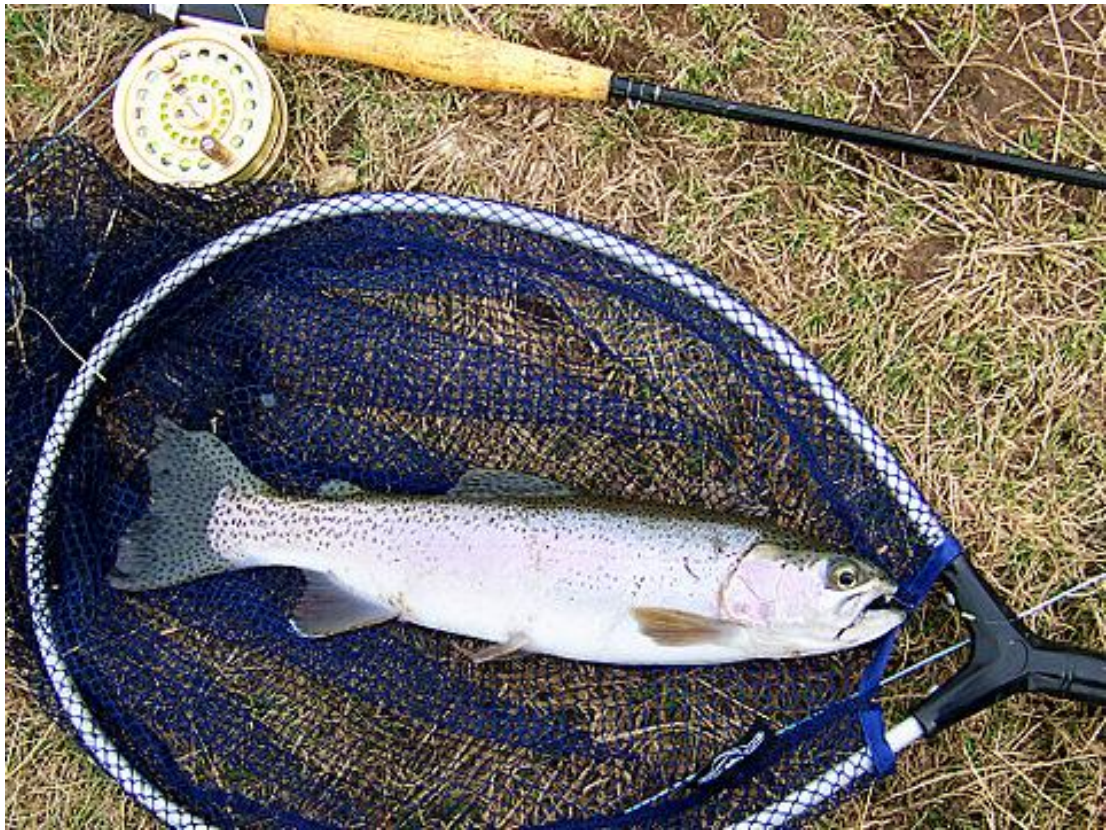
A Billy's rainbow