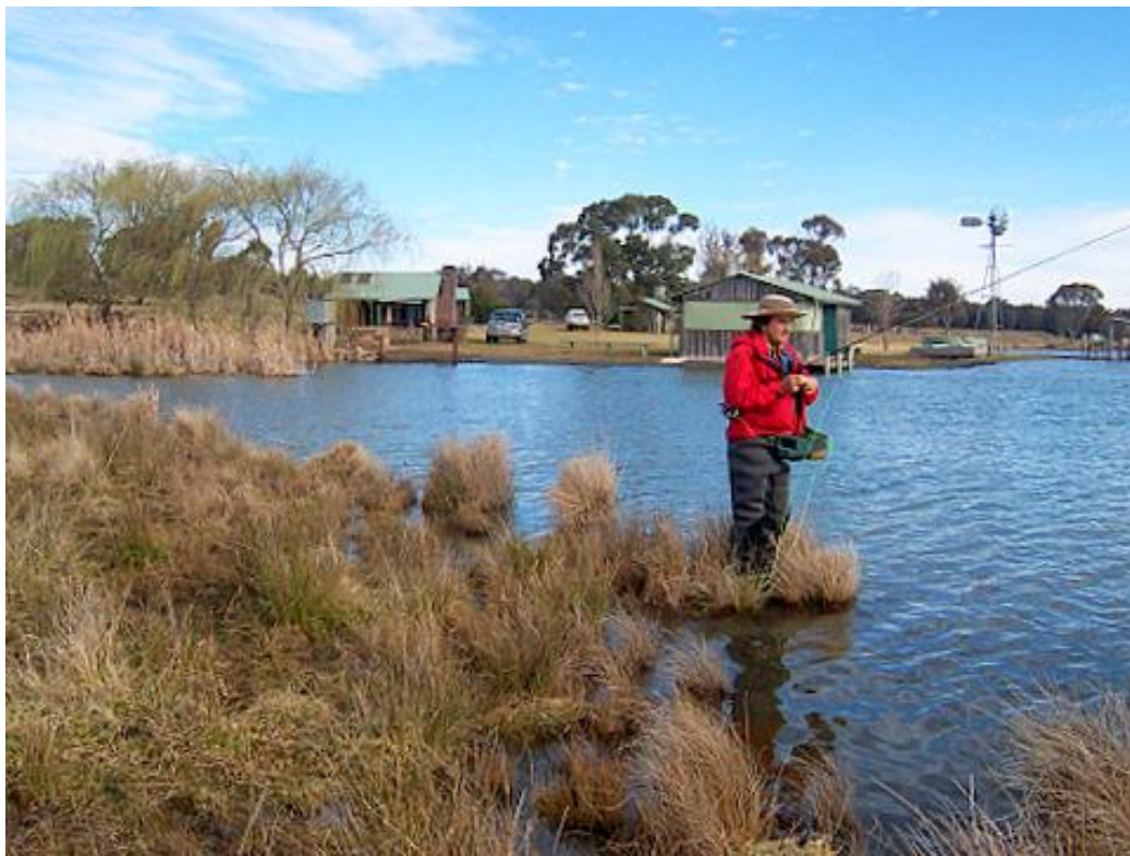
Denis spots a rise