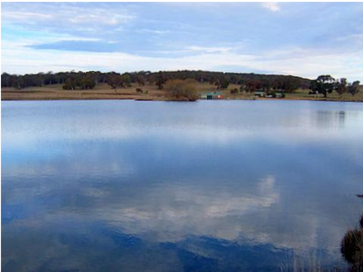
Looking back across the water at Billy's