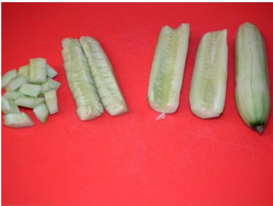
Cucumber, from peeling to cube