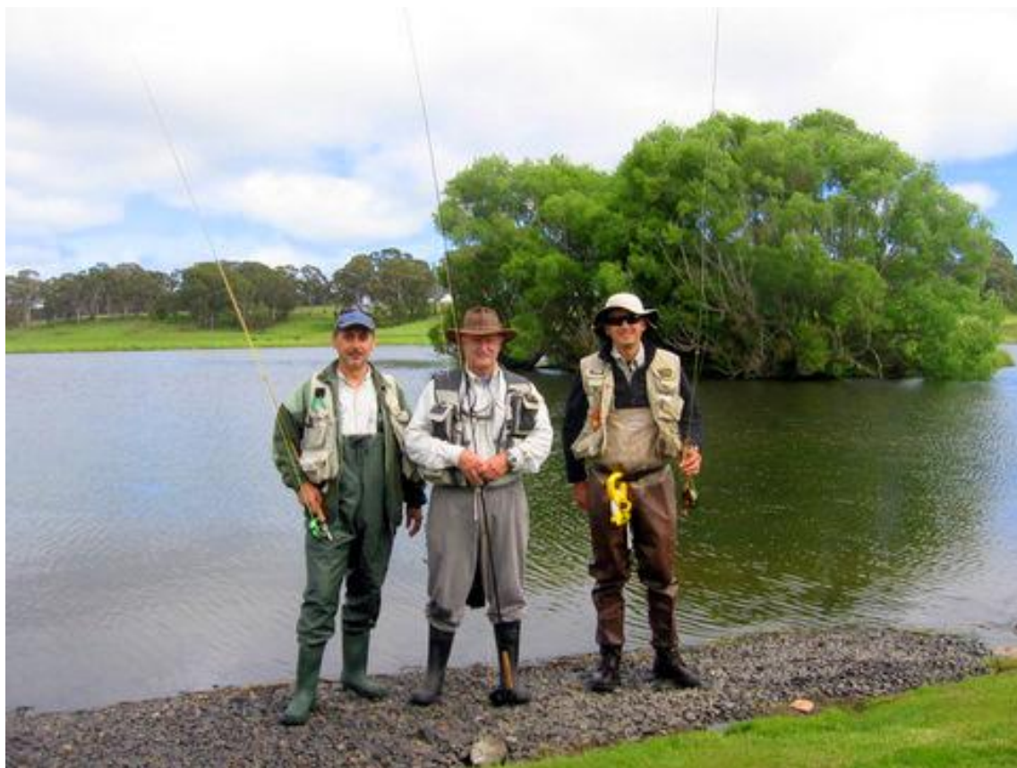
The three musketeers from last year's Billy's trip