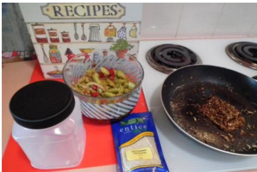
Brown the sesame in the pan, and add to mixture