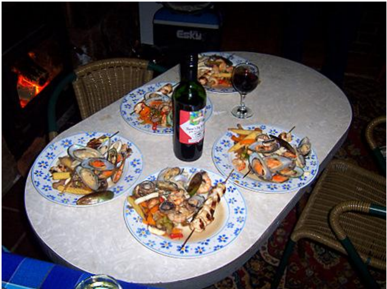
Tucker time at Billy's style