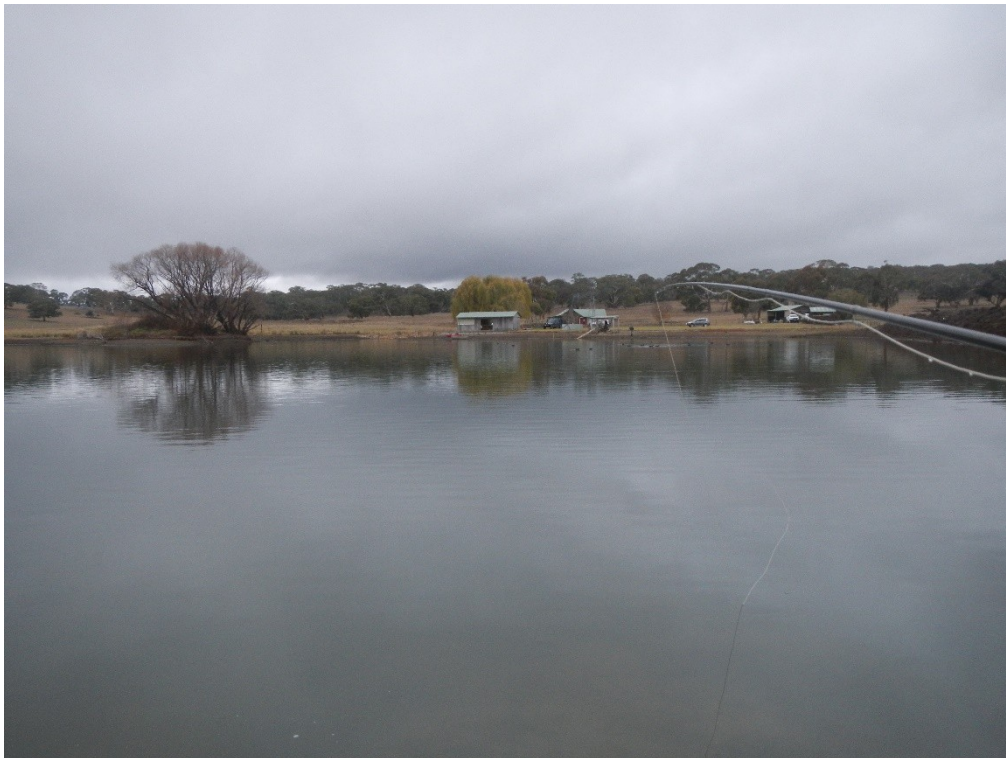
Saturday Morning calm but overcast conditions.

Saturday morning we awoke to overcast but calm conditions.