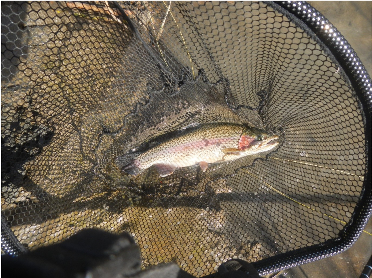
Rainbow Trout

Despite low water there was plenty of fish. Many in the 18-20cm range with good numbers larger.