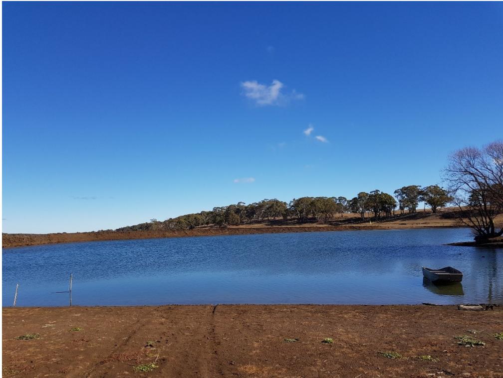
View from the edge of the dam on Friday

I arrived mid morning Friday after traveling up Thursday night with my family and overnighting with the in-laws in Tenterfield. Friday was a magnificent clear sky day.