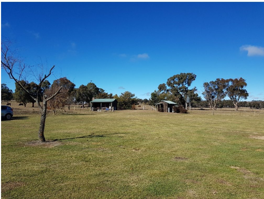
Looking back at the log cabin and amenities block on Friday

Reports from the group that arrived Thursday was the fishing was great, with Tony leading the way with 30-40 fish landed, fishing the shallows on the opposite side to the dam wall of the main lake. With water levels low, the owners were doing some maintenance on the dam wall which meant it wasn't as easy to fish as years gone by but will certainly be of value in years to come when water levels are higher resulting in a very deep edge to fish.