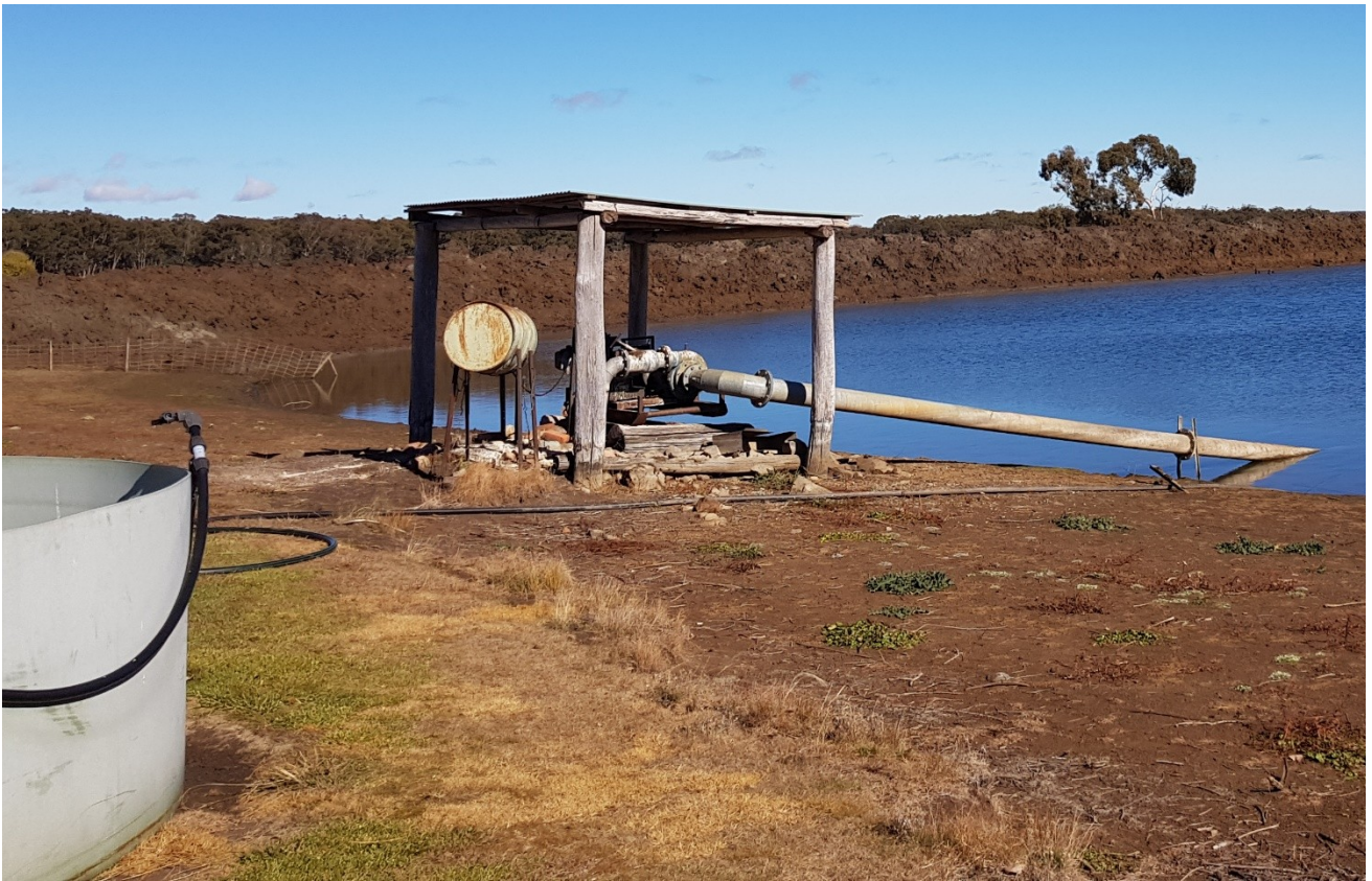
Photo taken with dam wall maintenance visible in the background