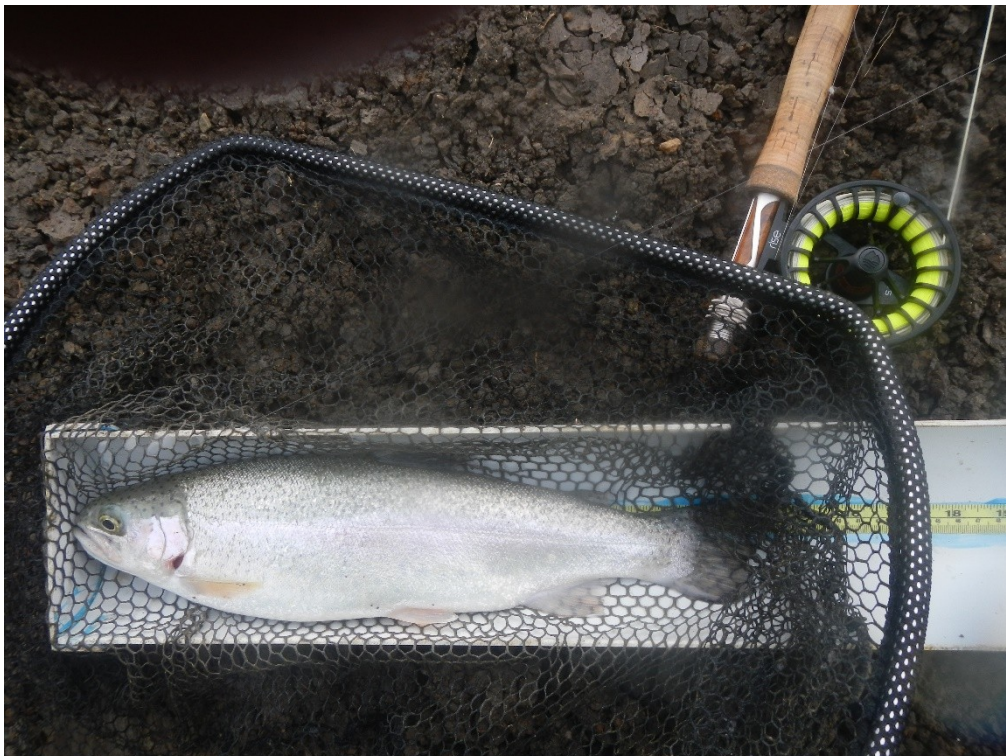
Rainbow Trout caught during the competition

The calm conditions allowed many anglers the opportunity to fish to rising which made for exciting fishing.